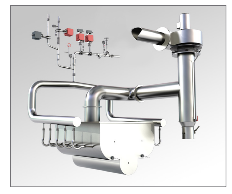
Freshline Bottom Injection Systems can supply the cryogen of your choice for maximum chilling efficiency

Air Products has over 15 years of experience retrofitting our Freshline Bottom Injection Cooling Systems on a variety of mixers and grinders at our customer's sites. We can also work directly with the equipment OEM's to install the system on new equipment prior to delivery to your site to save time and money.